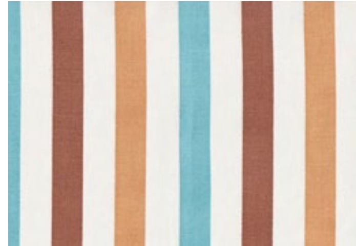
ROHET STRIPE - on Oyster