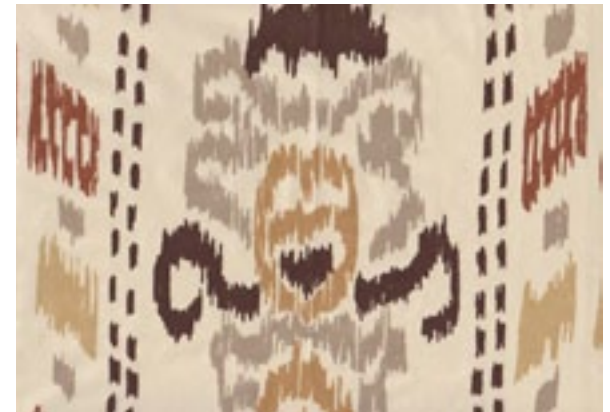
IKAT CRAZY - Caramel on silk