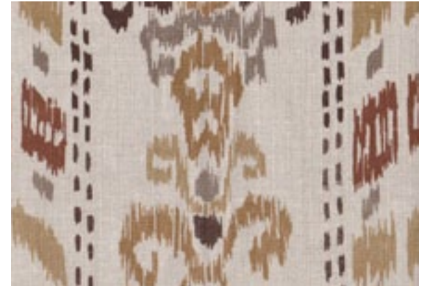
IKAT CRAZY - Caramel on linen