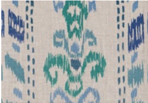
IKAT CRAZY - Blue on linen