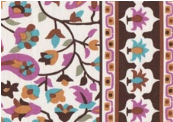
ROHET MULTI - on White