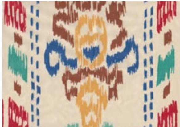
IKAT CRAZY - Multit on silk