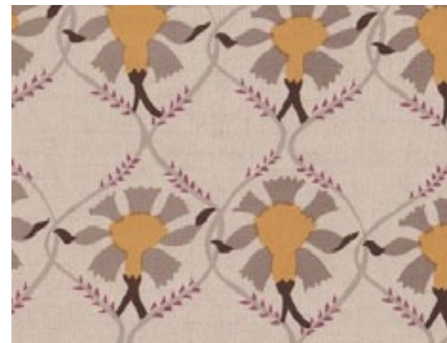
SAMODE - Yellow on canvas