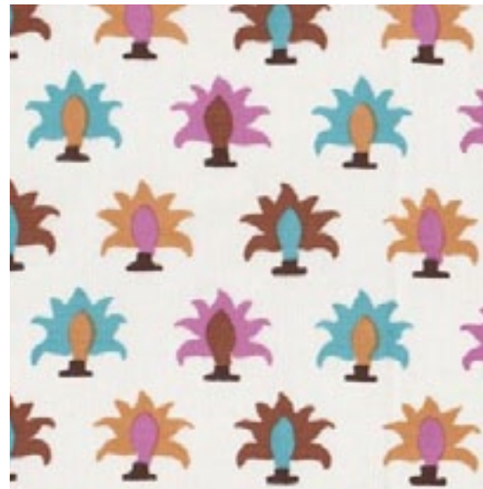
ROHET FLORA - Multi on oyster