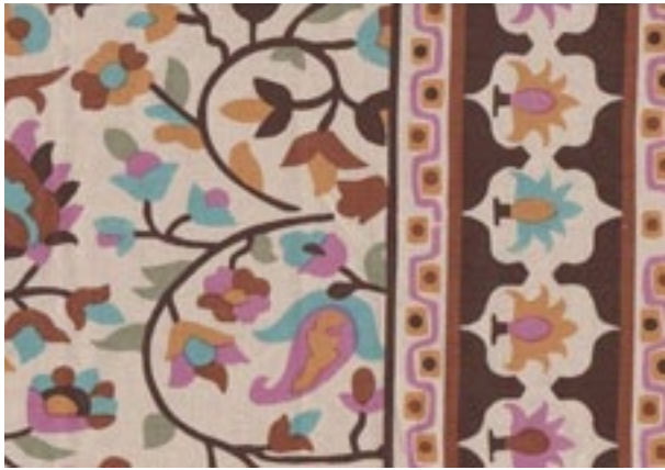
ROHET MULTI - on Natural