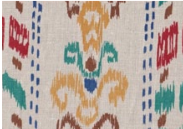
IKAT CRAZY - Multi on Linen