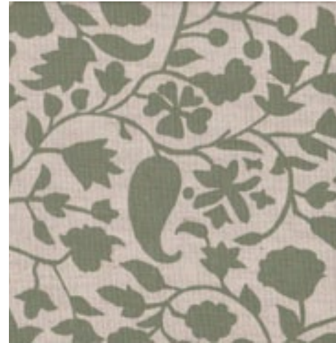
ROHET SOLID - Sage on natural