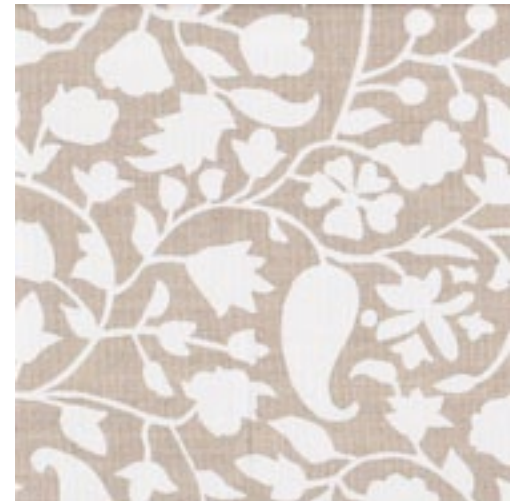
ROHET SOLID - White on natural