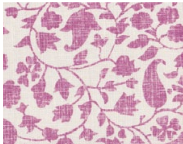
ROHET DISTRESSED - Pink linen