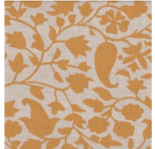
ROHET SOLID - Yellow on natural