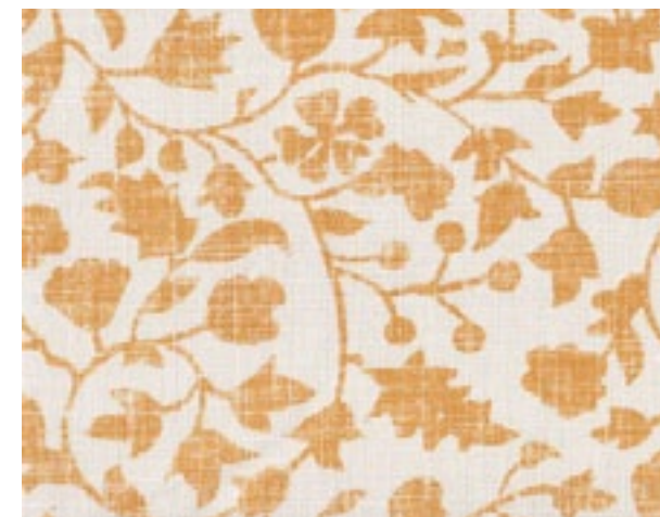
ROHET DISTRESSED - Yellow linen