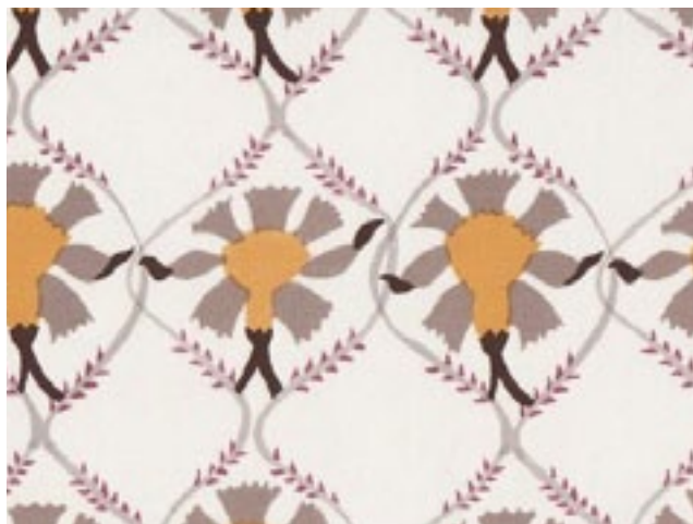
SAMODE - Yellow on oyster