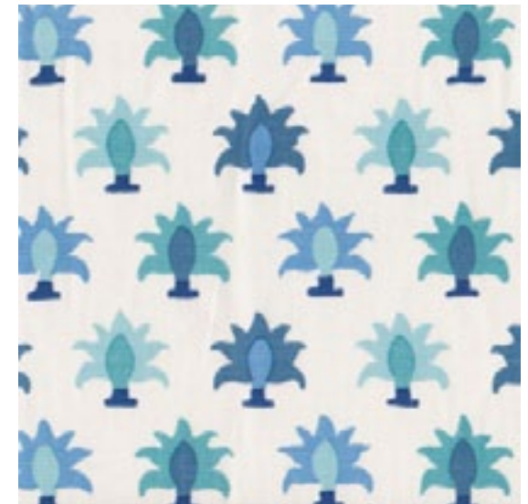
ROHET FLORA - Blue on oyster