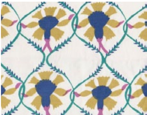
SAMODE - Blue on oyster