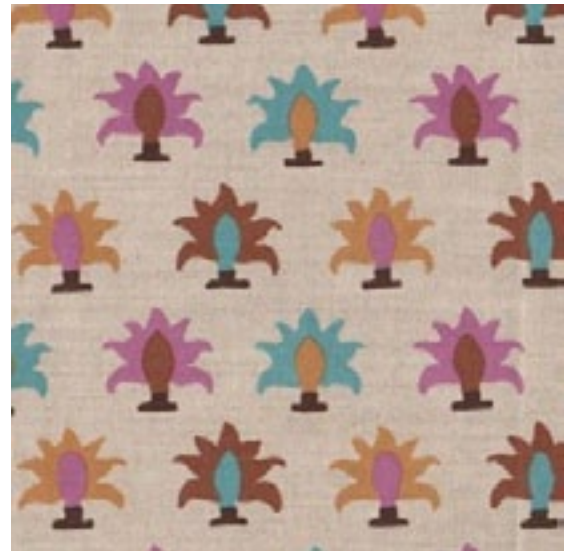
ROHET FLORA - Multi on natural