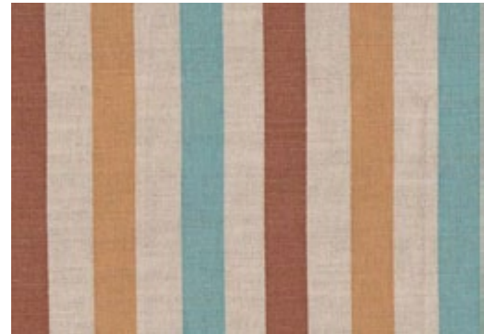
ROHET STRIPE - on Natural