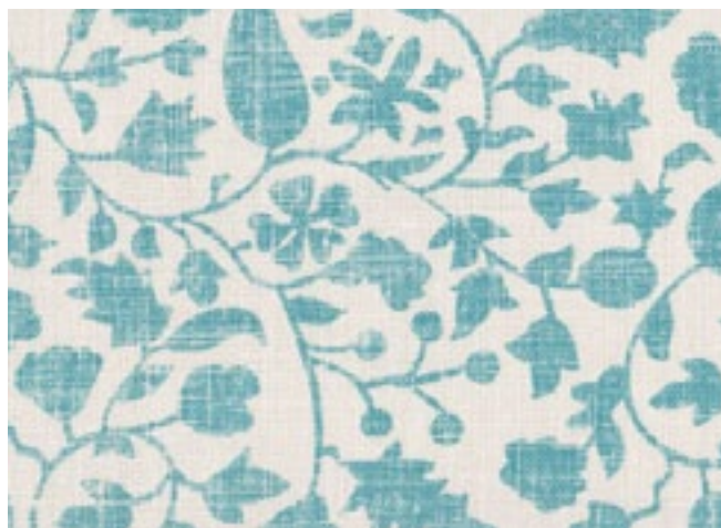
ROHET DISTRESSED - Turquoise linen