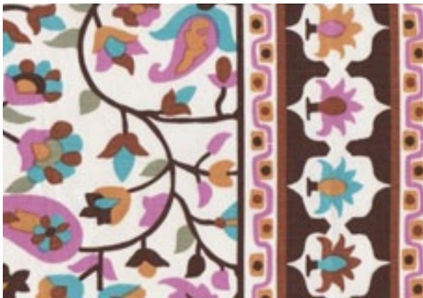
ROHET MULTI - on Oyster