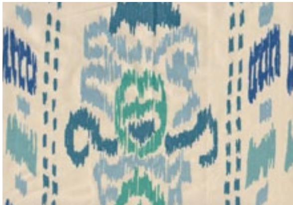
IKAT CRAZY - Blue on silk