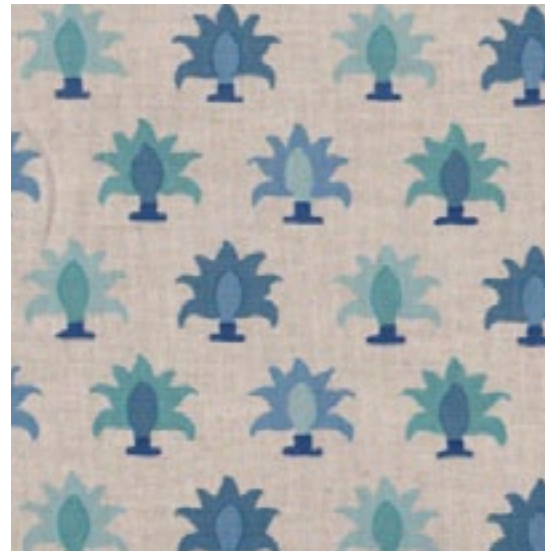
ROHET FLORA - Blue on natural